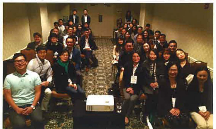
2018 KAGES general meeting and its first mentoring program during AAG annual meeting in New Orleans, LA.