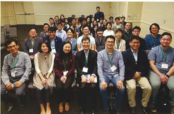
2017 KSEA Scholarship at 2017 KAGES general meeting during AAG annual meeting in Boston, MA.